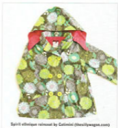
Spirit ethnique raincoat by Cotimini ( thesillywags.com )