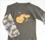
Reglan thermal with drum set detail by De L'F Guys ( fallguy.com )