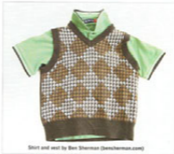
Shirt and vest by Ben Sherman ( bensherman.com )