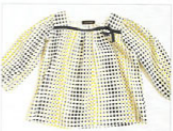
Pinkadot top by Edenstar ( edenstar.com )