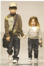
Crutch Klein F/W 2008