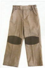
Pants with detail on knee by Ford ( fordkids.com )

Look what's in store for the coming Fall schoolyear